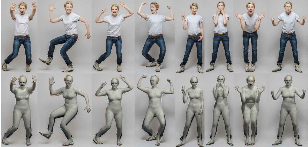
Figure 2: We learn a new 3D model of the human body called SMPL-X that jointly models the human body, face and hands. We fit the female SMPL-X model with SMPLify-X to single RGB images and show that it captures a rich variety of natural and expressive 3D human poses, gestures and facial expressions.

the major joints of the body. This is not sufficient to understand human behavior as illustrated in Fig. 1. OpenPose [15, 60, 70] expands this to include the 2D hand joints and 2D facial features. While this captures much more about the communicative intent, it does not support reasoning about surfaces and human interactions with the 3D world.