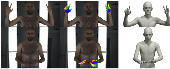
Figure 5: Comparison of the hands-only approach of [61] (middle) against our approach with the male model (right). Both approaches depend on OpenPose. In case of good detections both perform well (top). In case of noisy 2D detections (bottom) our holistic model shows increased robustness. (images cropped at the bottom in the interest of space)

To further show the value of a holistic model of the body, face and hands, in Fig. 5 we compare SMPL-X and SMPLify-X to the hands-only approach of [61]. Both approaches employ OpenPose for 2D joint detection, while [61] further depends on a hand detector. As seen in Fig. 5, in case of good detections both approaches perform nicely, though in case of noisy detections, SMPL-X shows increased robustness due to the context of the body. We further perform quantitative comparison after aligning the resulting fittings to EHF. Due to different mesh topology, for simplicity we use hand joints as pseudo ground-truth, and perform Procrustes analysis of each hand independently, ignoring the body. Panteleris et al. [61] achieve a mean 3D joint error of 26.5 mm, while SMPL-X has 19.8 mm.