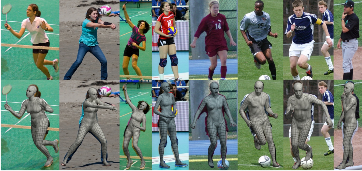
Figure 4: Qualitative results of SMPL-X for the in-the-wild images of the LSP dataset [33]. A strong holistic model like SMPL-X results in natural and expressive reconstruction of bodies, hands and faces. Gray color depicts the gender-specific model for confident gender detections. Blue is the gender-neutral model that is used when the gender classifier is uncertain.